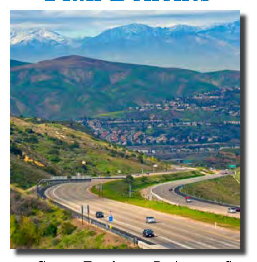
Orange County Employees Retirement System Summary Plan Description for Transportation Corridor Agencies General Members

This Summary Plan Description (SPD) is intended to provide you with general information. This SPD does not constitute legal advice, and OCERS cannot provide legal advice to members. If there are any discrepancies between the information in this SPD and the law, the law will prevail. Should you have legal questions, you are advised to consult an attorney.