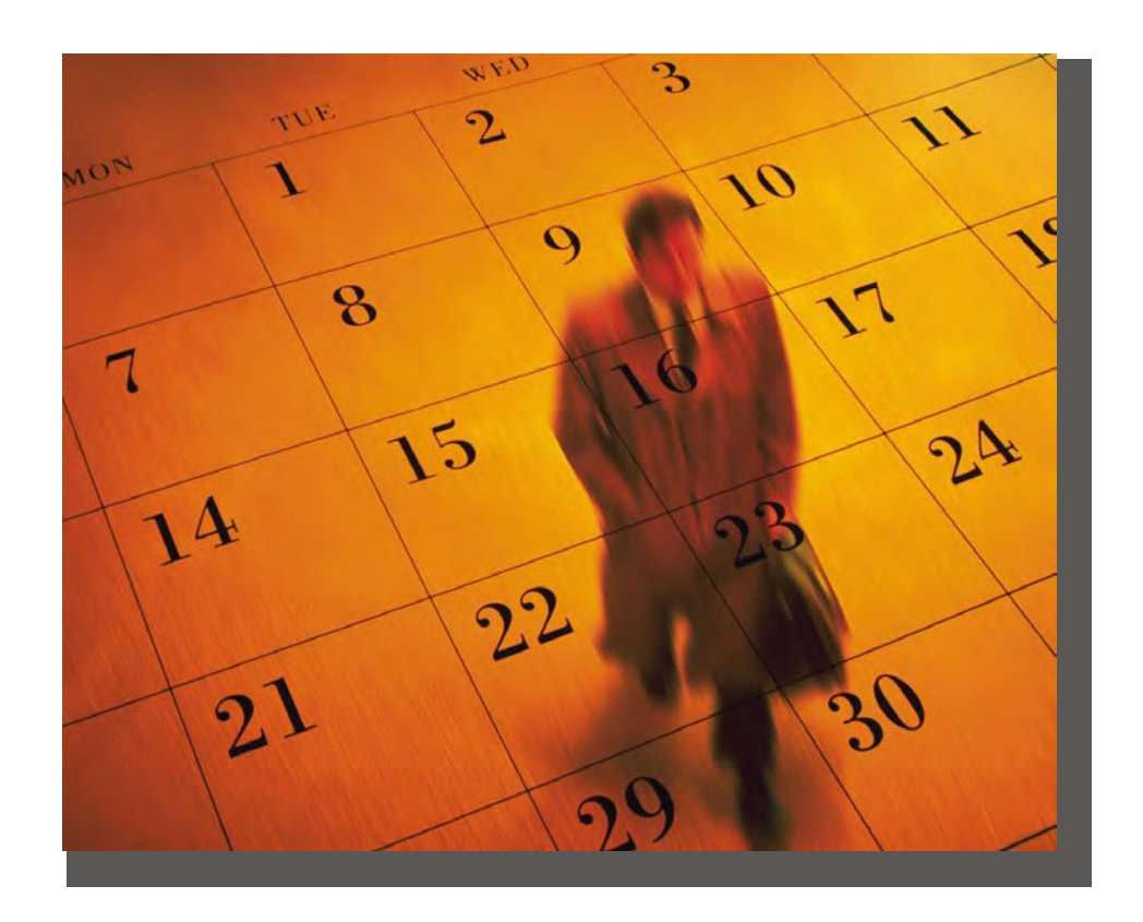
Orange County Sanitation District General Members 05/2025

<u>https://www.ocers.org/post/reciprocity-questions</u> https://www.ocers.org/sites/main/files/file-attachments/reciprocity 1.pdf