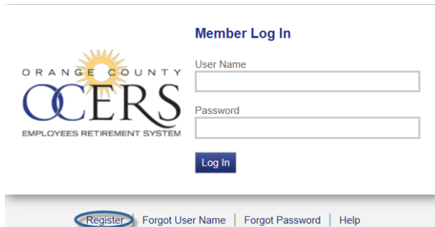
Figure 1 Member Self-Service (MSS) Portal Log In page